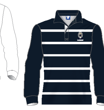
Rugby Top (Optional)