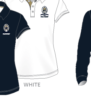
Polo S/S Girls