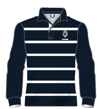
Rugby Top (Optional)