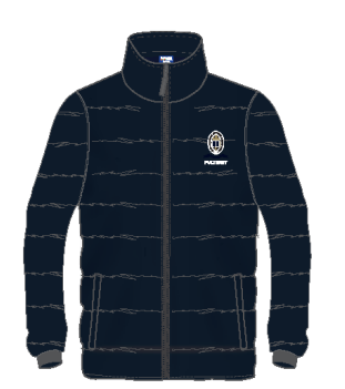
Puffa Jacket (Optional)