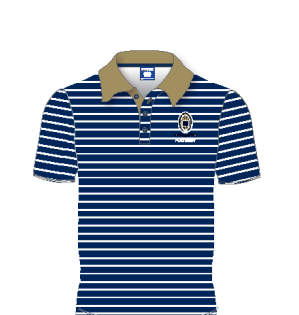
Knitted Polo (Compulsory)