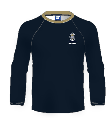
Training Top L/S Unisex