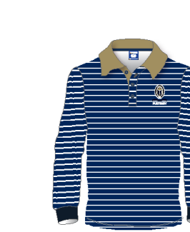
Knitted Polo (Optional)