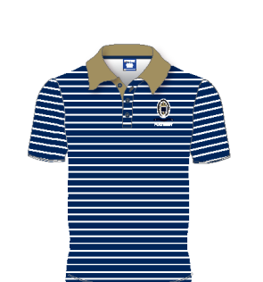
Knitted Polo (Compulsory)