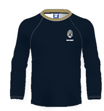
Training Top L/S Unisex