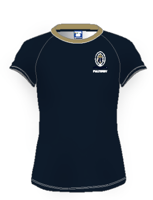
Training Top S/S Girls