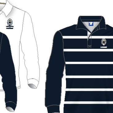
Polo L/S Unisex