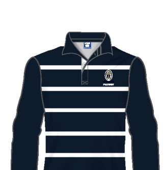
Rugby Top (Optional)