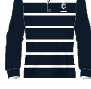
Rugby Top (Optional)