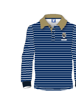
Knitted Polo (Optional)